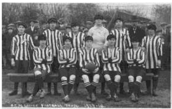
Ladies Football Team

For further information about our History Group, please visit our website – www.elmswell-history.org.uk – or contact our Secretary, on 01359-242601