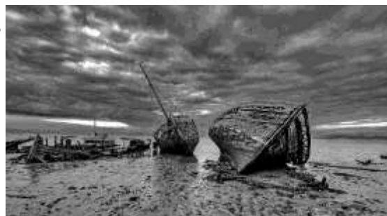
Laid Low by Geoff Walker

Part two of the evening involved volunteers giving presentations on displaying and describing their out-of-camera images and the steps taken to improve them before displaying the final image, followed by comments and suggestions.