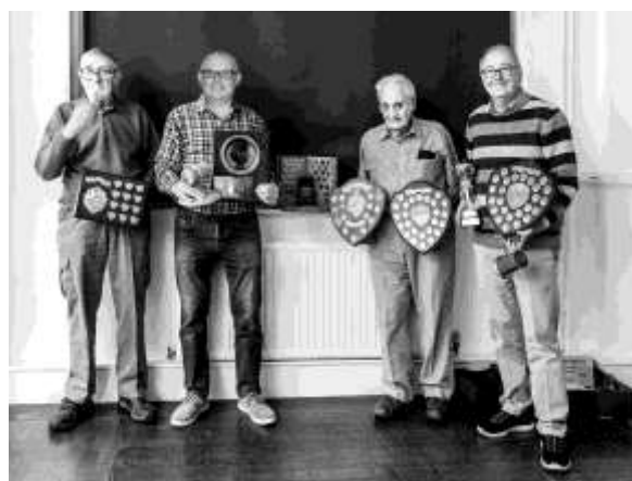
Trophy Winners 2023-24

Stowmarketcc@outlook.com or visit our website.